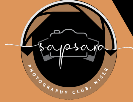
PHOTO GRAPHY COMPETITION